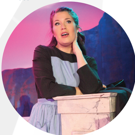
THE SOUND OF MUSIC