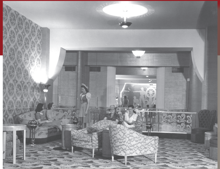
The Arrowhead Lounge, designed for "the smoker's comfort...every seat individually air conditioned providing exhaust of all smoke." The relief in the background is a reflection of the wall along the north stairway. Mirror was removed from the NorShor sometime between 2005 and 2010.

Minnesota Amusement Co. gives up its lease. Pitt Theaters and Cinema Entertainment Corporation operate the NorShor in subsequent years. In 1976, the Hotel Duluth Corp. purchases the NorShor/Orpheum/Garage buildings and the Temple Opera Block, then sells the buildings to Daniel H. Neviasser in 1977.