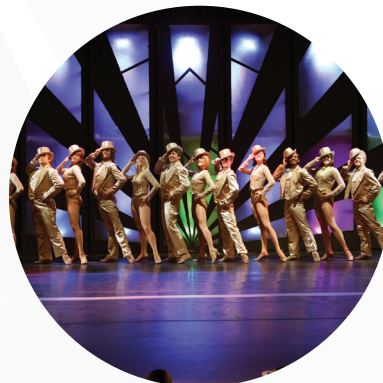
A CHORUS LINE