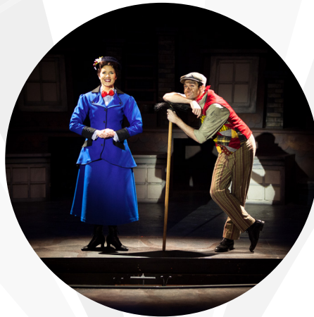
MARY POPPINS PHOTO CREDIT: DULUTH PLAYHOUSE

With more than 130 performances each year, and more than 350,000 individuals attending productions annually, the Playhouse is a thriving, multi-faceted organization, offering first-rate theatrical experiences to a wide-ranging demographic. The Playhouse also offers year-round educational programming for area youth and adults and a black-box theatre that supports multiple art disciplines open to area art groups and presenters.