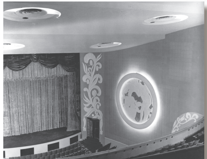
View of the NorShor's stage from the balcony. The NorShor boasted the largest screen in the "northwest"