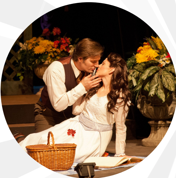
LA TRAVIATA