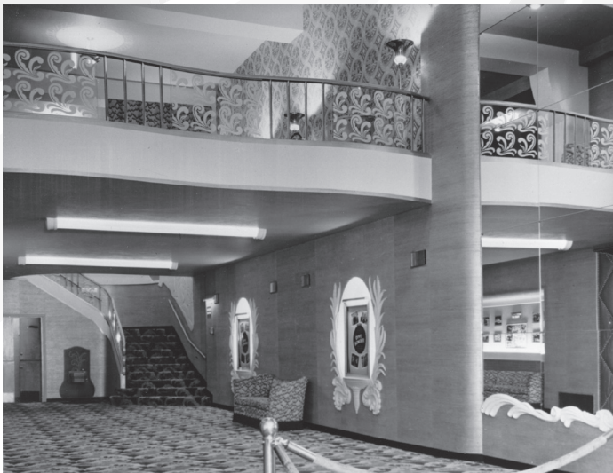
NorShor's Hall of Mirrors below the Arrowhead Lounge, September 1941

Today, after more than a century filled with complex and compelling stories, the NorShor Theatre will regain its rightful place of prominence in the center of our city.