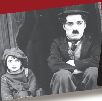
Charlie Chaplin (Pictured with Jackie Coogan)