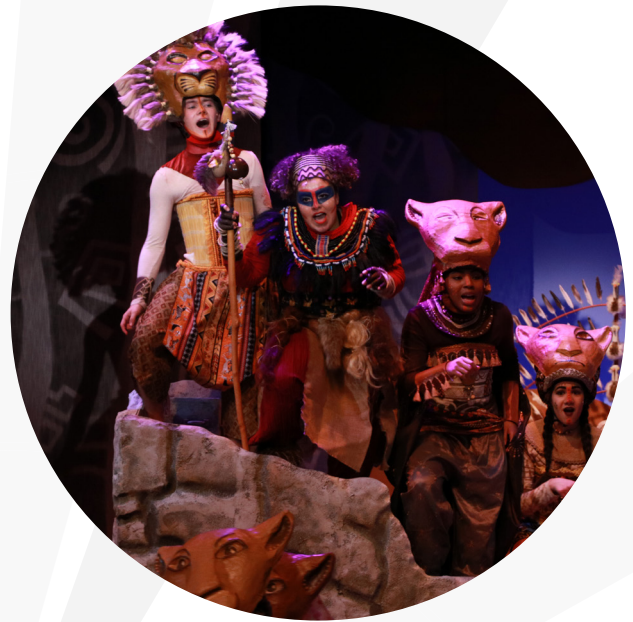
LION KING JR. PRODUCTION